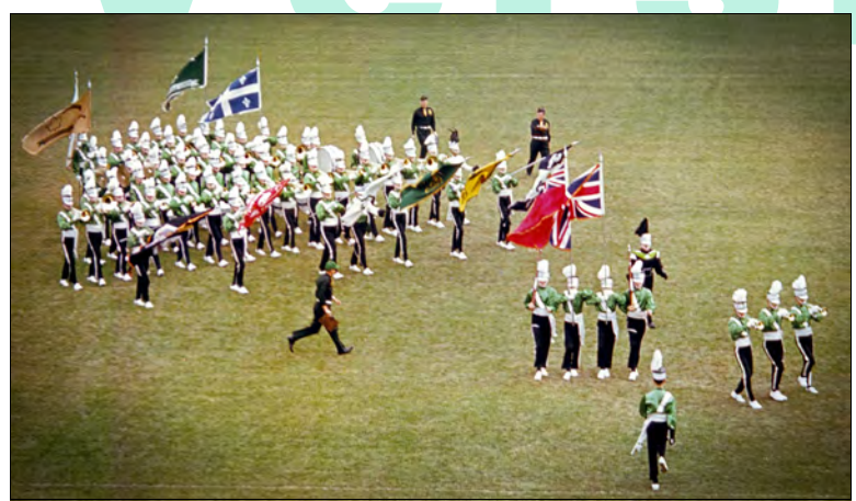
1963: Toronto Optimists playing El Cid (Nationals prelims, Waterloo)

Mother Nature co-operated this time and the contest was held as planned. Blessed Sacrament took the honours, which probably did not surprise anyone, and Garfield was a very close second. Holding down a respectable third, five and a half points out of first, were the