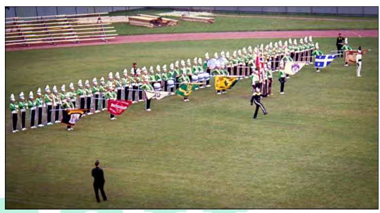
1963: Toronto Optimists Off The Line (Nationals Prelims, Waterloo)

The Geneva Appleknockers came second to the Optimists, but only by 5/10 of a point. Included in the field were the Niagara Militaires and the Hamburg Kingsmen. Not often, in the past had this Corps defeated the Militaires, who were always solid. The Hamburg Kingsmen, who were third at this show, were to become extremely good in later years. When this came about, they managed to beat some of the top Senior Corps in the United States and Canada.