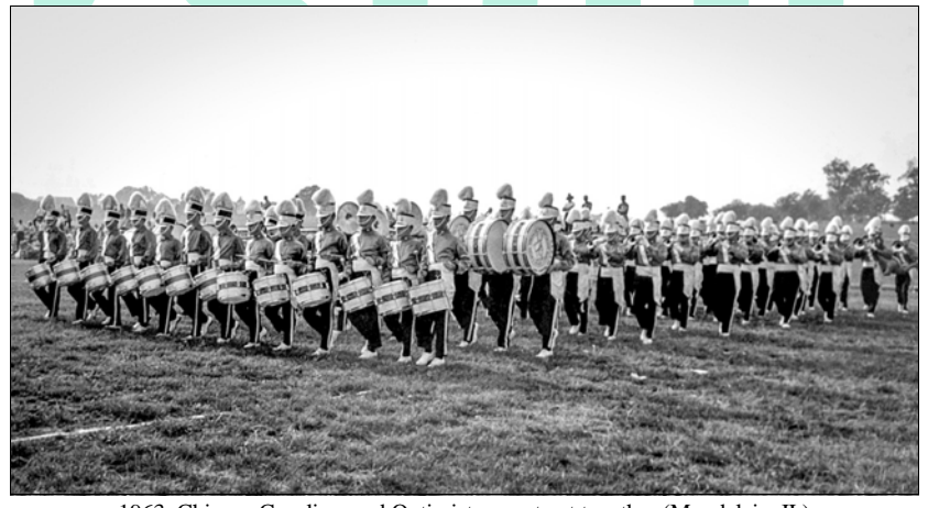
1963: Chicago Cavaliers and Optimists on retreat together (Mundelein, IL)

Chicago Cavaliers. This was their backyard, and it was no disgrace to lose to them. Even so, the Optimists took the high general effect trophy. As a sign of the goodwill that existed between the two units, the Corps combined to appear as one on the retreat ceremony. Pictures of the spectacle were used decorate the cover of a recording of this contest, put out later this year, featuring these two Corps.