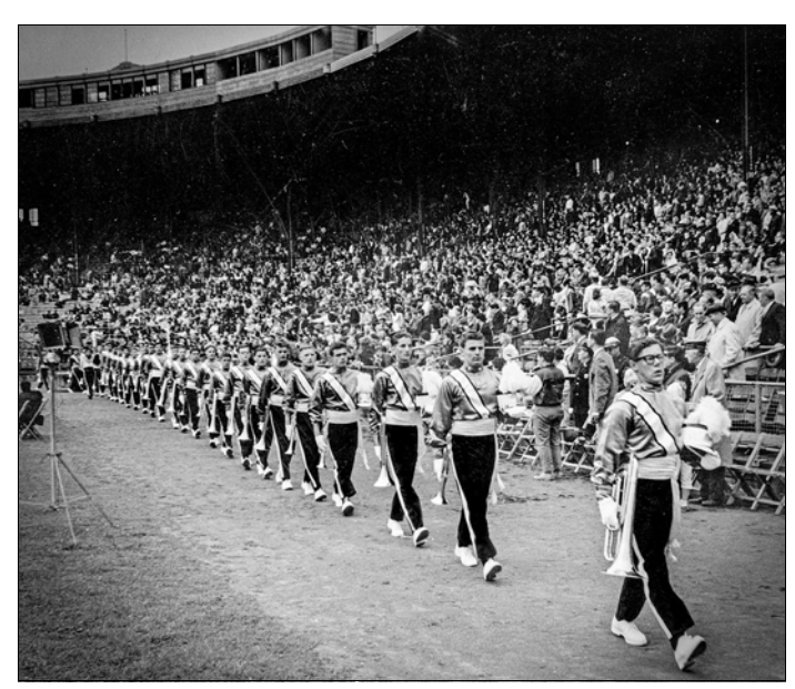
1963: Toronto Optimists (Preview of Champions)

Now, things began in earnest and the Corps, for the fourth time in five years, was off to Jersey City for the Preview of Champions. Leaving from the Canadian National Exhibition grounds, they headed south with high hopes and great expectations. This was partly engendered by the performances of the previous year and the shaping up of the current version of the Optimists. The Corps, however, was never really ready for such an early show and harsh reality intruded. All hopes were dashed by a fourth place finish, eight points out of first. More serious was placing four points out of third place which was occupied by a much improved St. Josephs of Batavia.