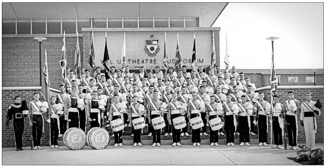
1963: Toronto Optimists Full Corps Photo (Waterloo)

Again, in the long-standing duel, things did not change. The Optimists captured title number six. For six consecutive years, this Corps had won the National Championship, this time by a three point margin over De La Salle. If this was not a record in North America, it was in Canada, although Scout House had won at Waterloo for ten consecutive years. But that was not the Nationals.