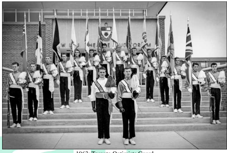
1963: Toronto Optimists Guard

Optimists, with the Corps appearing only in exhibition, sponsored it. It was strange that the Corps had competed in the first one, which was also sponsored by the Optimists. Maybe that first year there had not been enough local Corps ready at the time.