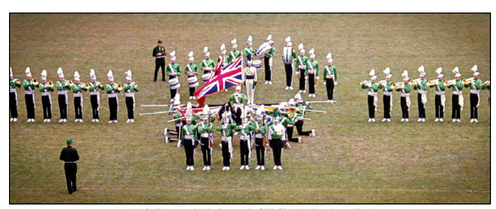
1963: Toronto Optimists end of El Cid (Nationals prelim)

team, or whatever, is not healthy for its overall welfare. The fact that De La Salle always provided a good challenge helped to maintain interest among fans and other Corps. Optimist success was never so great a s to appear