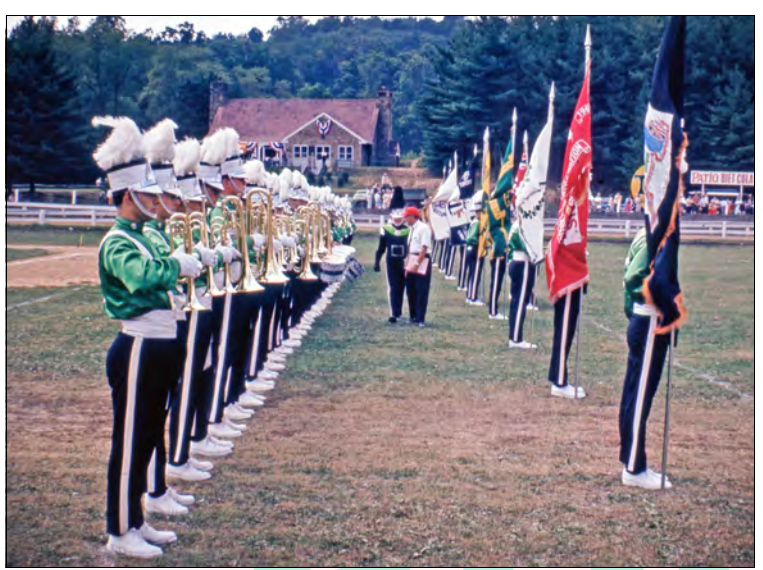
1963: Toronto Optimists On The Line

fine performance", summed up the show. The brevity of these comments can be seen as a reflection of the attitude that sometimes existed between these Corps. Although neither of them