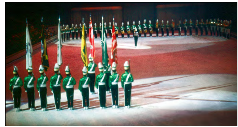
1963: Toronto Optimists at the Ice Capades

More shows were scheduled before the beginning of the season proper. There was an appearance at the "Sound of '63", run by York Lions. Before their demise, the mini-Corps had entertained at the C.D.C.A. convention and were well received. They also performed with the main Corps at the Kitchener-Waterloo Band Festival. However, the show of most interest was held in St. Catharines and featured the first appearance in Canada of the New