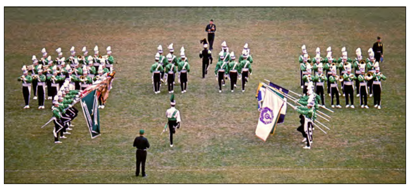
1963: Toronto Optimists