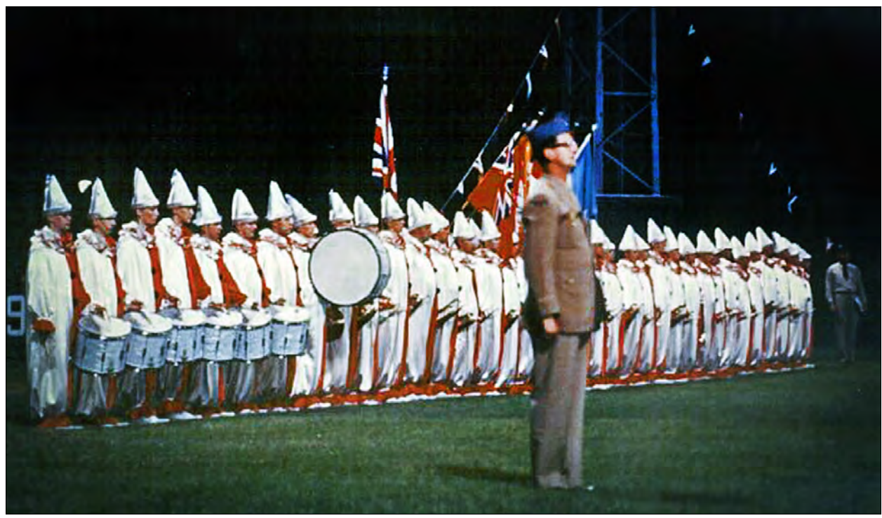
1957: Jolly Jesters at Roosevelt Stadium

To anyone who wonders about the name "The Jesters", it has an interesting origin. They were originally the Royal Canadian Army Service Corps, when connected with the army. In their other role as a competing Drum and Bugle Corps, they wore real clown outfits as a uniform and used the name of "Jolly Jesters". Later, after severing all connections with the army, they switched to more military, but still flashy, uniforms. Along with this, they dropped the "Jolly" from their name, becoming simply "The Jesters". Always good, they were among the several colourful Senior Drum Corps of note in Canada.