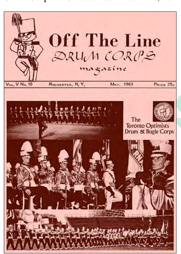
1963: May Cover of "Off The Line"

Other Corps in Canada had these units, namely, Preston Scout House, and De La Salle. It was