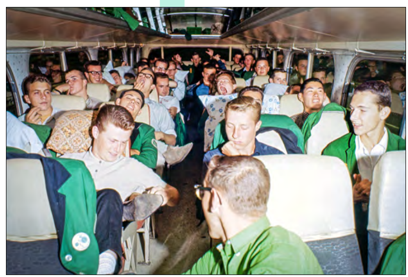
1963: On the bus

In the June issue of this publication, six long paragraphs were devoted to the New York Skyliners. For the Optimists, four lines and the statement, "A